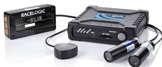
VBOX Lite with OLED screen