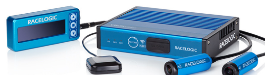
VBOX HD2 with OLED screen